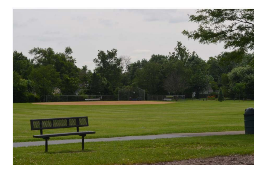
Two practice ball fields are in very good shape.

Parking lot is small and many patrons park along the residential street.