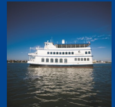
Cruise Around Charleston Harbor