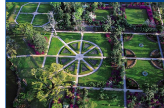
Visit Middleton Place and Gardens