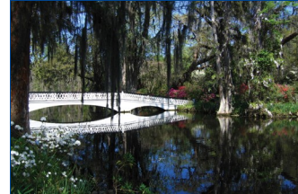
Take in the Picturesque Views of Charleston

Day 7: Enjoy a Continental Breakfast before departing for home... a perfect time to chat with your friends about all the fun things you've done, the great sights you've seen and where your next group trip will take you!